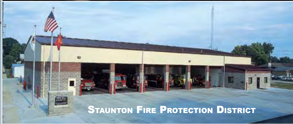
STAUNTON FIRE PROTECTION DISTRICT