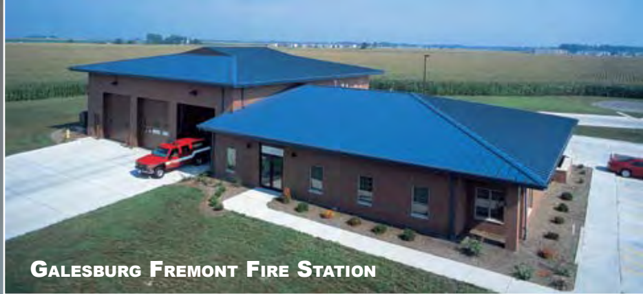
GALESBURG FREMONT FIRE STATION