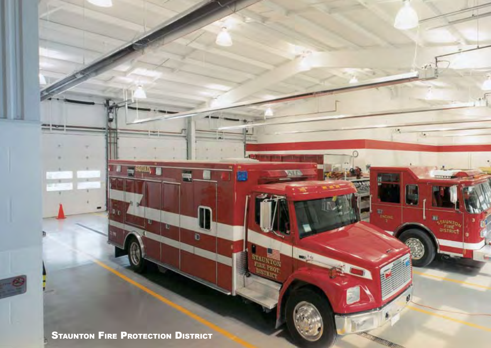
STAUNTON FIRE PROTECTION DISTRICT