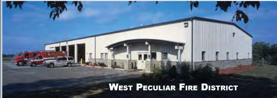
WEST PECULIAR FIRE DISTRICT